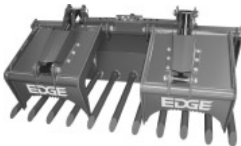
Industrial Tine Grapple