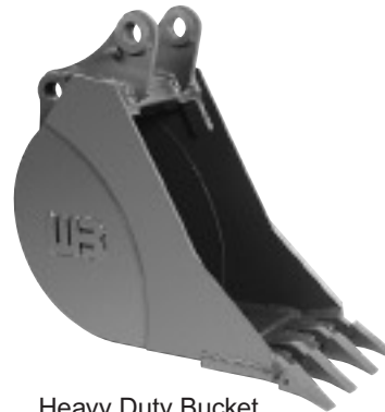
Heavy Duty Bucket