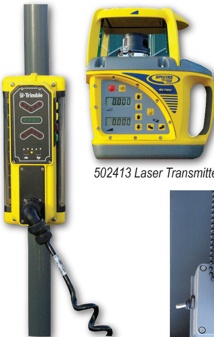
502413 Laser Transmitter