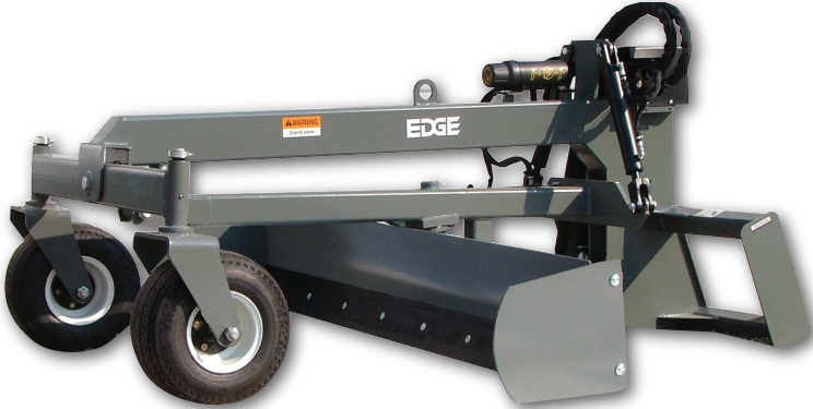
Shown with optional end plates.

New EDGE Grader Blade is now smoother than ever featuring an in-cab control box with a new proportional current valve.