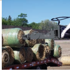
Easily pick up material rolls from trucks.