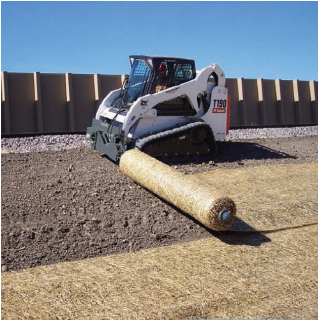
Quickly lay erosion control mats.

The EDGE material unroller's stem is used to pick up erosion control material rolls off of a truck, and can hydraulically pivot 180 degrees to unroll erosion control material on either side of the skid steer loader. It has a free wheeling stem hub, and the arm floats above or below horizontal position; it can be locked into upright position for transport as well. Contractors can cut their labor in half! Comes complete with hoses and flat face couplers.