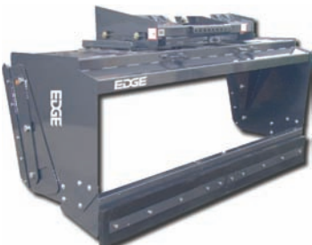
Optional Pull Back Kit

Optional Pull-Back Kits allow for down pressure on the rubber edge to draw snow or other materials away from confined spaces such as loading docks or buildings. This Pull-Back Kit includes the rubber cutting edge.